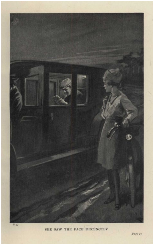
SHE SAW THE FACE DISTINCTLY